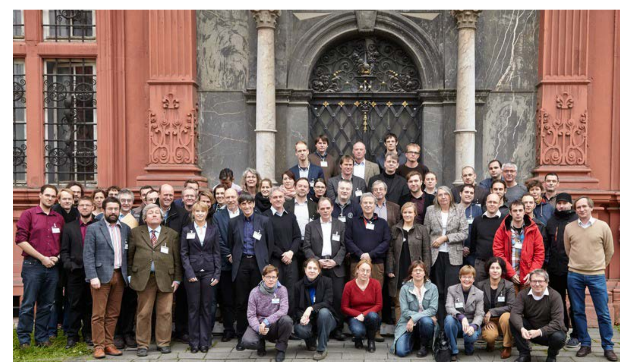
Plenary meetings are organized annually to bring together all members of the program in order to define research objectives and to discuss recent research results like this meeting in Mainz in 2014 (RGZM; Iserhardt).