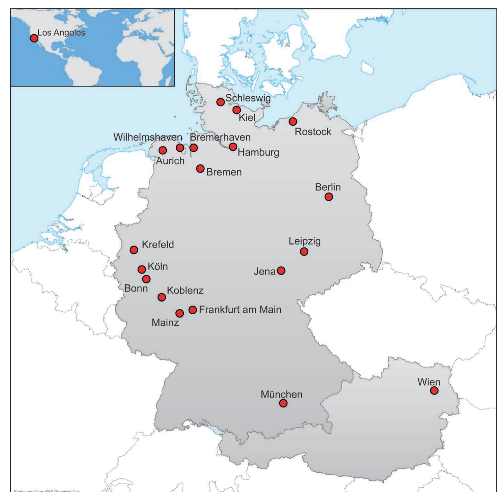
A total of 34 institutes (Universities, Museums, State offices and research facilities) located in Germany, Austria and Iceland are participating.